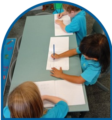
Spelling and Handwriting

Room 12 has loved settling into the new term, arriving excited to learn every day! Take a look at the photos below to see the tamariki enjoying some of their favourite activities, including Spelling, Maths, Reading, Writing, Art, and Discovery Time.