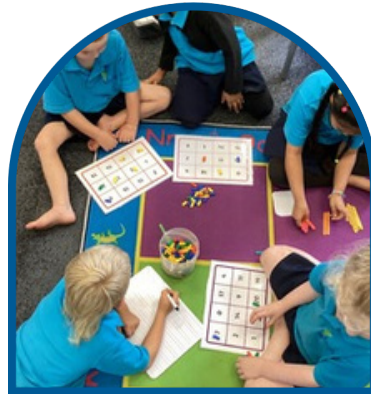
Maths Games and PrIme