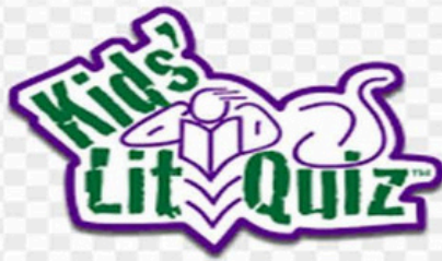
Lit Quiz Team 1