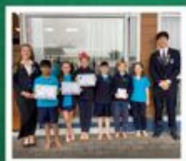
Awesome job Year 5s!