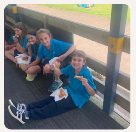
Enjoying Pizza from our Market Day rewards