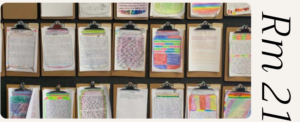
Dream Jars we created during Writing