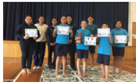
Ngā Puāwaitanga (Years 5-6)