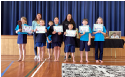
Ngā Tupuranga (Years 3-4)