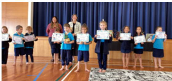
Ngā Kākano (Years 0-2)