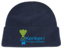
Roll Over Beanie