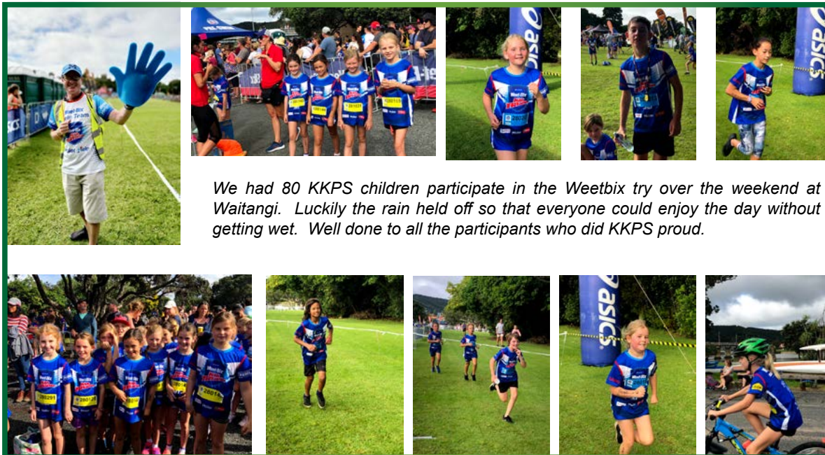
We had 80 KKPS children participate in the Weetbix try over the weekend at Waitangi. Luckily the rain held off so that everyone could enjoy the day without getting wet. Well done to all the participants who did KKPS proud.