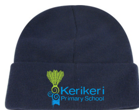
Roll Over Beanie

Please phone 094071527 or email logo@ddgold.co.nz